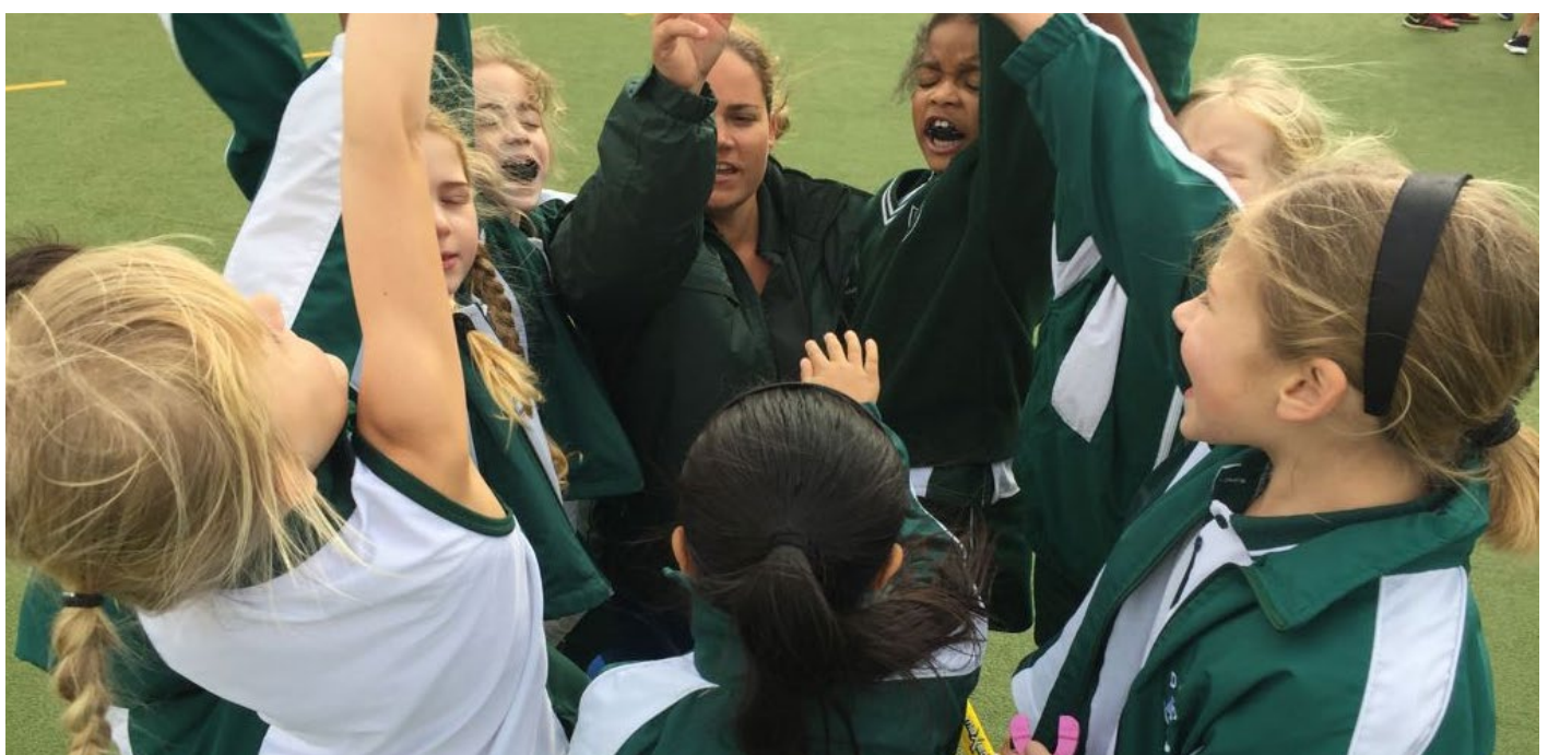
Learning outside the classroom: The Grade 1 girls celebrate after their hockey tournament last Friday. Well done!